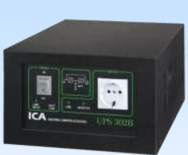
PN – SERIES