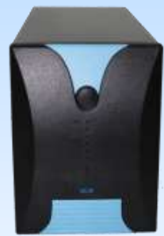
CT – SERIES