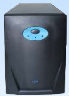
CS – SERIES