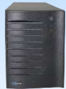
CE – SERIES