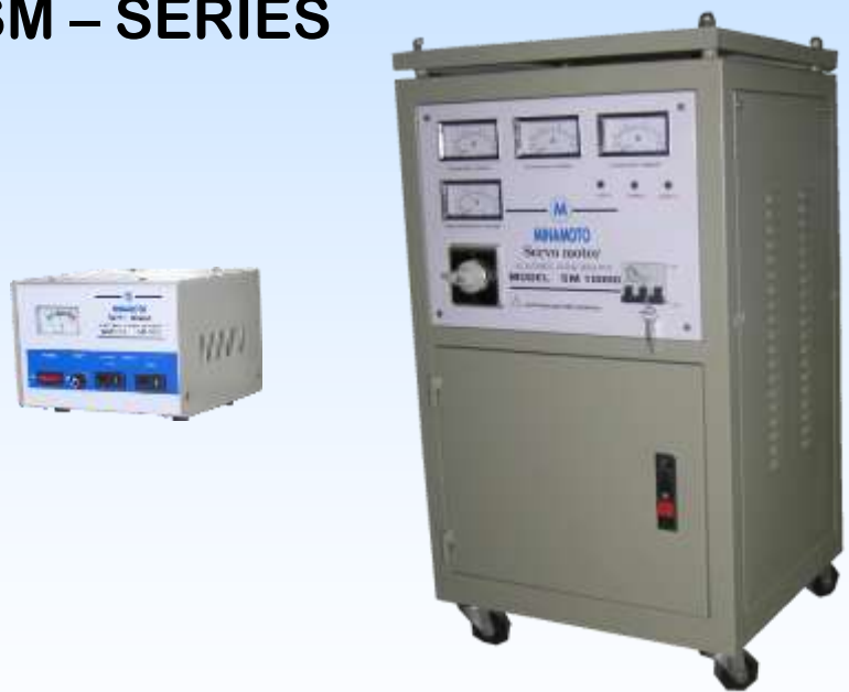
SM – SERIES