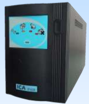
ST – SERIES